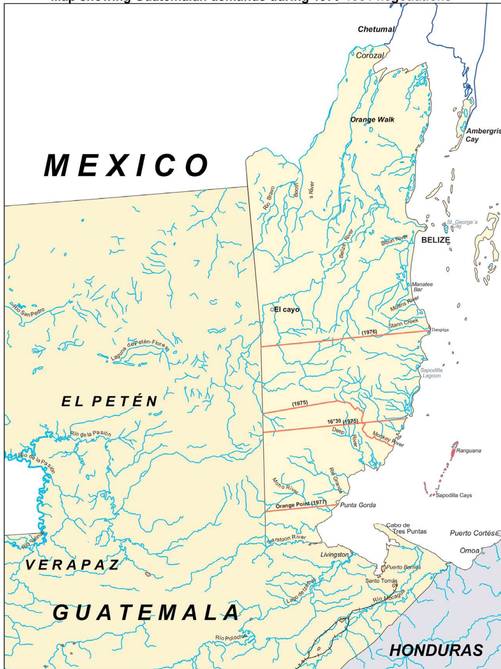
Map showing Guatemalan demands during 1975-1981 negotiations