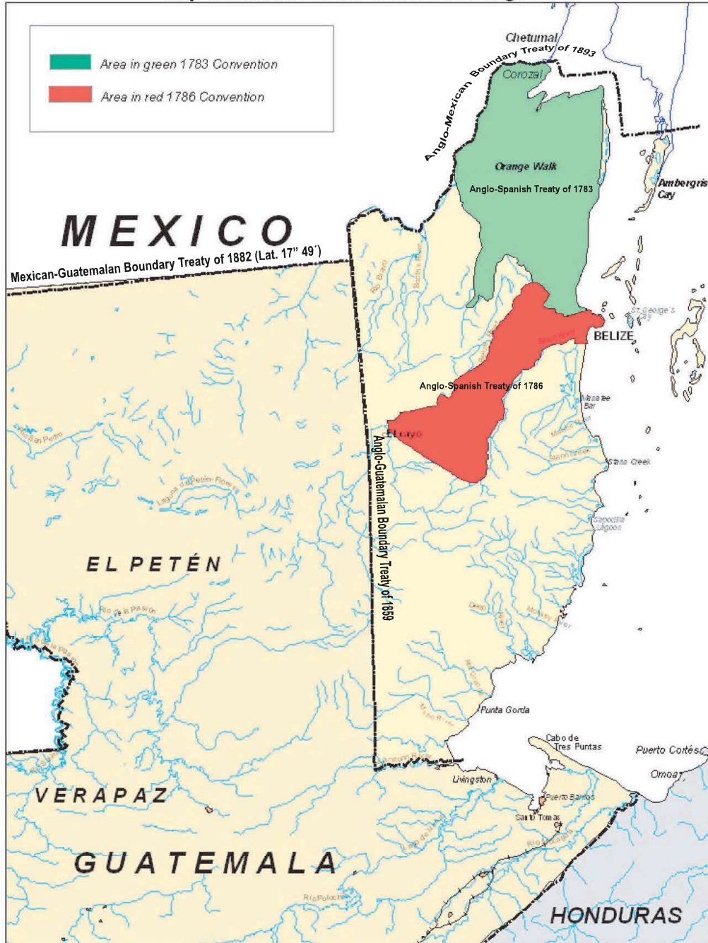
Map to illustrate Border Treaties affecting Belize