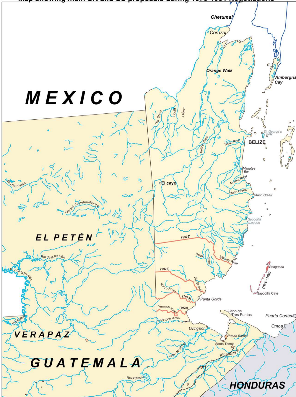
Map showing main UK and US proposals during 1975-1981 Negotiations